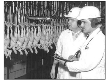
The Department of Agriculture inspects more than eight million birds every year.

Other laws are just instructions about something that must be done, such as installing new security procedures at the nation's airports. A law like this will not include every last detail about how it should be carried out. Instead, the law will authorize the executive branch to decide these details. The rules the executive branch makes about how the law will be carried out are called regulations . Regulations have power similar to laws. Some regulations make activity illegal, and others give instructions for how something must be done.