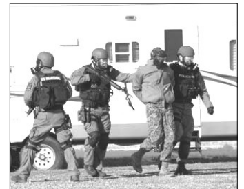
The U.S. Marshals Service is the oldest federal law enforcement agency. Marshals provide court security, hunt fugitives, and offer witness protection.