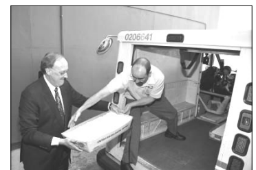
A U.S. Postal Service employee works hard to deliver your mail.

Remember that most of the day-to-day activity in the executive branch involves ordinary people doing the work that needs to be done: an FBI agent conducts an investigation, a soldier participates in training exercises, or a worker monitors a nuclear reactor at an energy plant. The executive branch needs people to answer phones, program computers, file papers, do scientific research, process mail, fly airplanes, and clean bathrooms. In fact, the federal government is the nation's largest employer, and most of those jobs are in the executive branch.