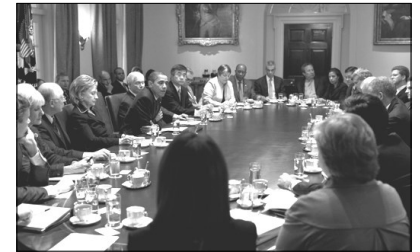
President Obama and his cabinet.

The president appoints a secretary to lead each department. (But the head of the Department of Justice is called the Attorney General). These secretaries do more than just lead a department. They are the president's cabinet —a group of people that give advice to help the president make important decisions. Officials who hold these cabinet-level positions such as the Secretary of Defense, the Secretary of Education, or the Secretary of Homeland Security, are very important players in the executive branch.