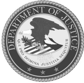
There are 52 agencies and offices within the DOJ.