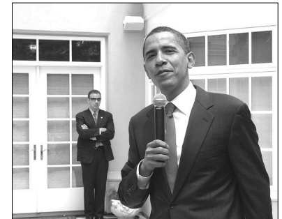
The ever-present Secret Service has the president's back.

We depend on many parts of the executive branch to keep us safe and to keep order. For example, the Department of Homeland Security (DHS) is responsible for protecting the United States against all kinds of threats. It includes agencies that deal with terrorism, natural disasters, and border protection. It even includes the Secret Service, whose agents protect the president! Inside the DHS, the Federal Emergency Management Agency (FEMA) responds to natural disasters to help people get the help they need in an orderly way. The Coast Guard, also part of DHS, patrols our nation's coastlines to watch for threats and help boats in distress.